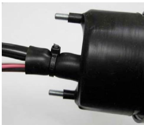
Figure 3. Installed Zip Tie